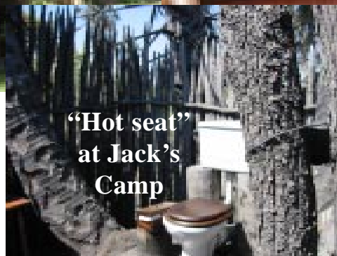
“Hot seat” at Jack’s Camp

The next morning as we were eating breakfast, we discovered a hyena had “stolen” our guide’s flight bag and after a search of the area,