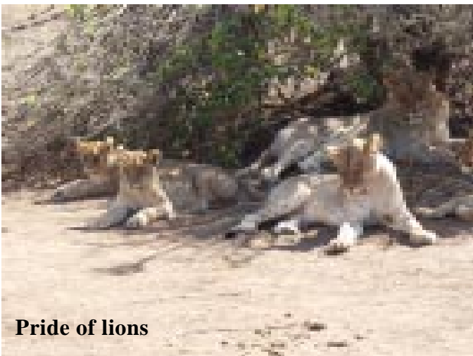
Pride of lions

Warren and the three other guys who would be listed as PICs then went to Lanceria Airport where two of the pilots were checked out in Cessna 172s and Warren and another pilot checked out in 182s. The planes were in pretty good shape, with ours built in 1975.