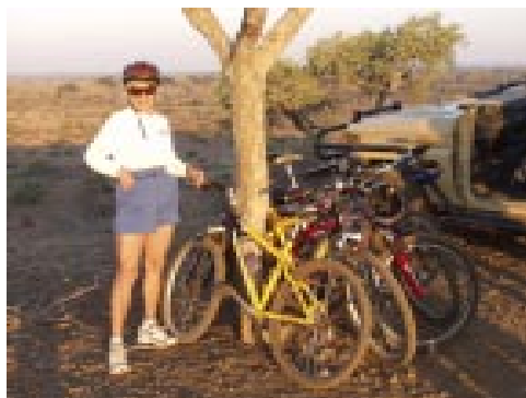
“Meals on wheels”