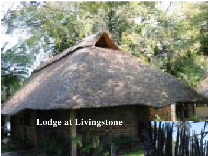
Lodge at Livingstone