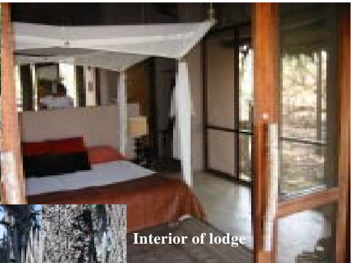
Interior of lodge

very large elephant who was butting his head against the palm trees to shake down the nuts. Then without warning, this elephant decided to join us for dinner. Our host had us quietly move to one side while he single-handedly took on this giant beast by jumping up and down, clapping his hands and encouraging him to move on. At any moment the elephant could easily have stomped him into the ground, but fortunately, after a brief stand-off, decided to move along. Of all the times not to have a camera, this was it, resulting in everyone bringing their cameras with them to all the rest of the meals.