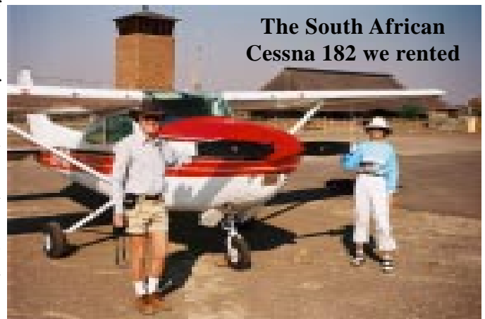
The South African Cessna 182 we rented

Currently, approximately 70% of the blacks are unemployed