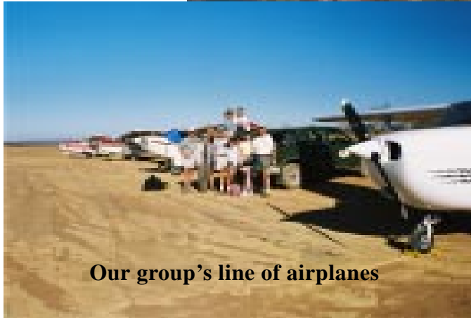
Our group's line of airplanes

having an afternoon snack prior to going on the game drive.