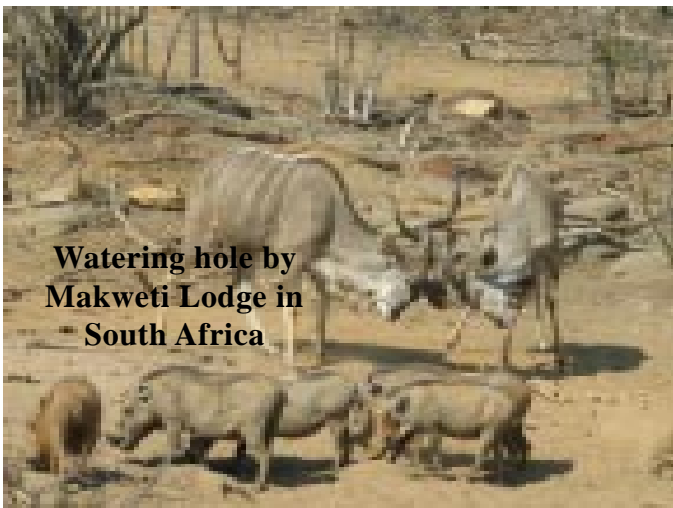
Watering hole by Makweti Lodge in South Africa

The next afternoon, two of us pilots went on a mountain bike ride through the bush with several other guests, again accompanied by a guide carrying a rifle. Someone later referred to us as "meals on wheels." The ride was challenging as we rode through soft sand, across rocks and finally met our nemesis at "Disappointment Hill." This "hill" went straight up, and apparently only a couple of exceptionally strong riders have ever actually been able to ride up to the top. I had all I could do to push my bike up the thing!