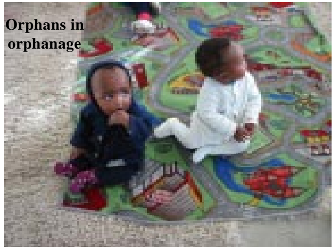
Orphans in orphanage

entering the pattern for landing, you radioed you were "joining and landing." Instead of "position and hold," it was "line up and wait." Instead of reporting the amount of fuel on board, you reported your "endurance." You also were